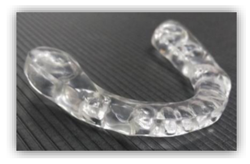
Fig. (5). Occlusal splint.

The treatment started with a stabilization phase, which consisted of a Tanner occlusal splint on the lower arch (Fig. 5) and endodontic treatment (Fig. 6). An occlusal splint was used to evaluate the patient's adaptability to the planned occlusal changes. The patient did not report any discomfort related to this OVD increase.