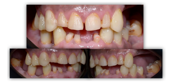
Fig. (7). Completed composite build-up of canines and premolars.

Composite (Filtek Z350, 3M ESPE, USA) build-ups of the maxillary and mandibular canines and premolars at the planned raised OVD and canine-guided occlusion were done first (Fig. 7). After that and after obtaining final impressions to do the onlay dentures, the maxillary and mandibular incisor teeth were covered with Bisacryl material, Protemp 4 (3M ESPE, Germany) that was injected in the putty index (3M ESPE, USA) which was made from the waxed-up duplicated model. These temporaries were used to restore the function and aesthetics of the anterior teeth and to act as a mock try-in (Fig. 8). After this, dental casts from alginate impressions were made to act as a guide for the technician in building up the onlay denture's acrylic teeth.