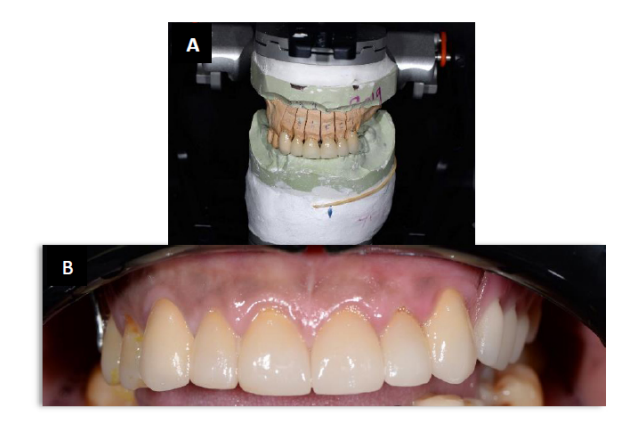
Fig. (13). (A) Single crowns in the semiadjustable articulator. (B) Multiple cemented crowns inside the patient's mouth.