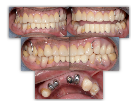
Fig. (16). Different intra-oral views after 2 years of follow-up.