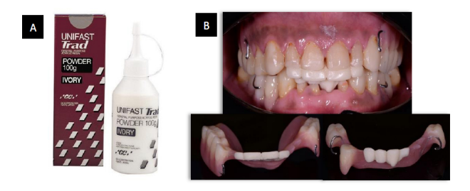
Fig. (9). (A) Unifast Trad acrylic resin (GC, Japan) was used to fabricate the onlay teeth (B) Maxillary and mandibular onlay acrylic removable partial dentures.