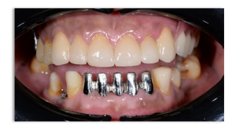
Fig. (14). Special design overlay type Co-Cr mandibular partial framework inside the patient's mouth.

In the definitive stage, anterior single crowns were fabricated with the aid of a facebow and semi-adjustable articulator (Fig. 13A). The crowns were cemented with RelyX Ultimate Clicker (3M ESPE, Germany) (Fig. 13B).