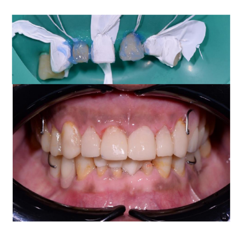
Fig. (10). Intraoral view of the composite build-ups after cutting the upper onlay acrylic denture teeth.

Due to the COVID-19 pandemic, the patient was not reviewed for a long time. Due to this, there was one fractured composite and wear and staining of multiple composite buildups (Fig. 11). However, the patient was satisfied, and no complaints were recorded. The teeth and restorations were polished, and full-mouth prophylaxis was done for the patient.